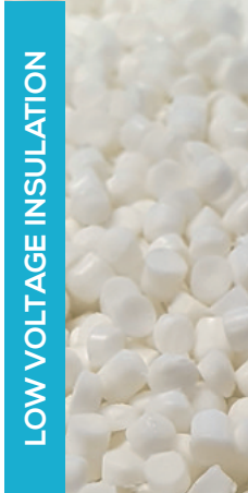
CROSSLINKABLE RUBBER COMPOUNDS